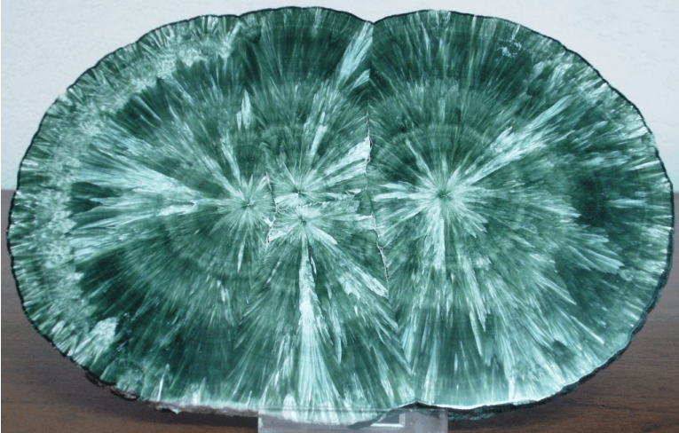
Clinochlore, variety Seraphinite from Russia, a polished slice from a stalactitic formation! This is actually about 8.5" across. We have three from $300 to $800.

Here are photos of the most exceptional pieces we've picked up recently! Because of their great beauty and rarity, they are on the pricey side. We thought we'd show a photo with the price range, and if you're interested, you can call or Email us and we'll send you details and photos.