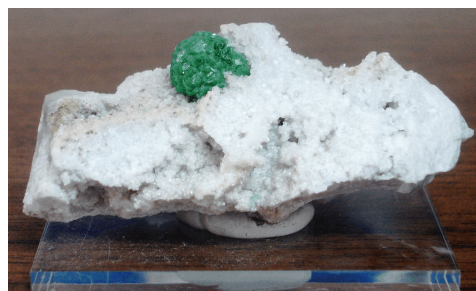
Variscite on quartz—Variscite ball is about 3/8" across, matrix about 2.5", for $100.

Cavansite on Stilbite , Wagholi Quarry, Pune, Maharashtra, India. We have a source for excellent specimens of this gorgeous mineral that we featured in April 1996 and April 2006—just check the photo! And they are being offered at the bargain prices you've come to expect from us. We have matrix specimens like the one in the photo for $100, $150, $200, and $250. Email if you'd like to see more photos.