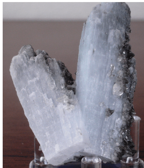
Anhydrite, about 2" across and 2.5" high for $30.

The source of our specimens in 1997 has been out of business for some time. A few years later, we found another excellent source, a retired digger who was selling off his self-collected material, and we got a lot of excellent crystals from him for a few years, but none on matrix. He eventually sold out his entire inventory to another dealer, and we haven't had a source of reasonably priced pieces, until now!