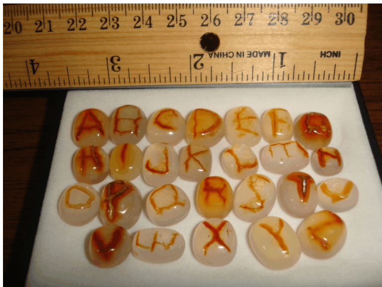
Alphabet Agate set from Indonesia. Yes, they are natural! Price upon request.

And we got some Tanzanite crystals from Tanzania, from $200 to $400.