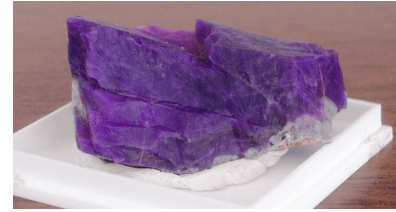
Sugilite, South Africa, 4 specimens from $80 to $320