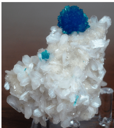
Cavansite, ball on top is about 5/8" across, specimen sits up about 2.25", $150 piece.

Cavansite on Stilbite , Wagholi Quarry, Pune, Maharashtra, India. We have a source for excellent specimens of this gorgeous mineral that we featured in April 1996 and April 2006—just check the photo! And they are being offered at the bargain prices you've come to expect from us. We have matrix specimens like the one in the photo for $100, $150, $200, and $250. Email if you'd like to see more photos.