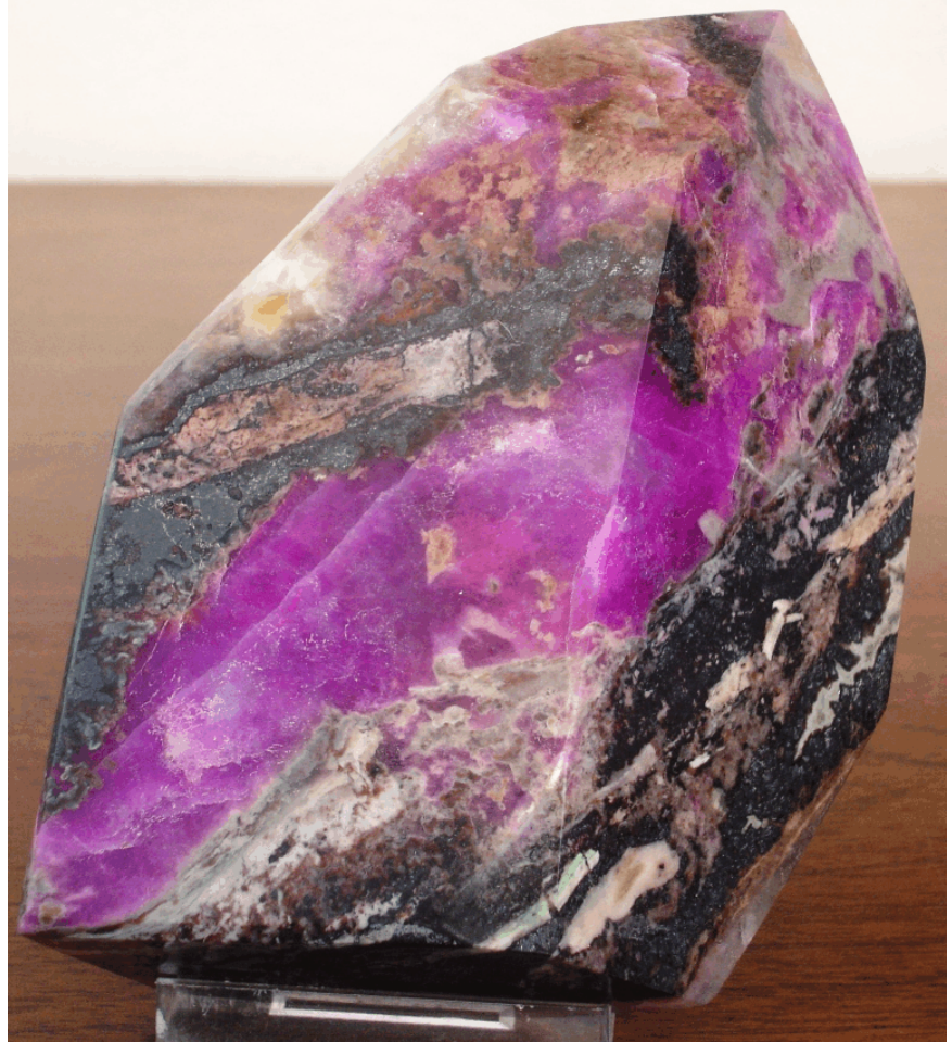
Sugilite in matrix, polished, from South Africa. 3 pieces available from $260 to $480.